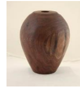
George Van Dyke Hollow Form 2 2019 Shenandoah Valley Walnut 6" x 5" x 5" $250