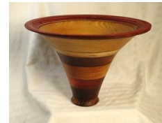
Richard Webster Bowl with Flair 2019 Multi-woods (maple, cherry, mahogany, plywood, Zebra) 10" x 7" x 7" $180