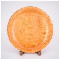
Michael Summers Maple Platter 2019 Big Leaf Maple 1.75" x 11" x 11" $350