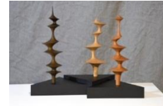
Duane Schmidt Forest Twist 2020 Cherry, chestnut, maple, tulip poplar (wood from approx. 250-year old Belair Mansion tree collected by Phil Brown), enamel paint 10.5" x 13" x 8" $375