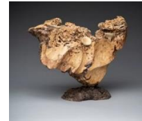
Lynda Smith-Bugge Craggy Hollows: Inflorescence #15 2019 Maple, turned boxwood 10" x 13" x 6" $625