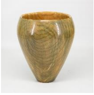
Tim Aley Sassy One 2019 West Virginia Sassafras softly stained green 7.5" x 6.5" x 6.5" $300