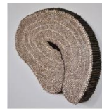
George Lorio Infolding

2018 Found twigs on armature surrounded by tree bark 84" x 90" x 90" $9,000