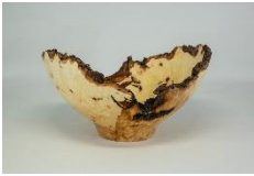
Tim Aley Wings of Fancy 2020 Natural edge Maple Burl turned wet and left to dry 9.5" x 8" x 5" $260