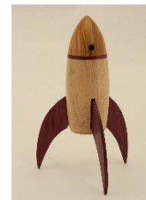
William Flint Rocket #1 2017 Maple, Olive, Purpleheart, water-based lacquer 6.5" x 2" x 2" $100