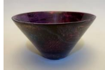
Mike Colella Mystic Vessel 1 2019 Oak, stabilized with purple and pink resin 3" x 5" x 5" $250