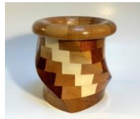
Jay St Michel Twisted Vase 2019 Cherry/Bloodwood/Holly, Segmented and Twisted 6" x 6" x 6" $300