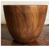
Mauricio Peredo Serenity 2020 Walnut 5.5" x 6.5" x 6.5" $150