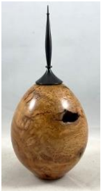
Jeff Struewing Cherry Trio 1 2020 Cherry Burl, Ebony, Corian (Hollow form with removable threaded finial) 6" x 3" x 3" $125