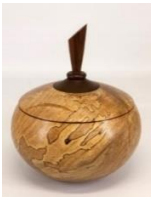
Robert Anderson Spalted Hollows 2019 Hollowed Spalted Birch with Walnut finial 7" x 6" x 6" $130