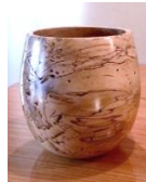
David Termini Nature's Surprise 2017 Spalted maple, finished with multiple coats of tong oil, hand rubbed to a smooth finish 10" x 9.5" x 9.5" $350