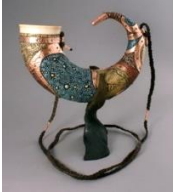
Michael Kehs Fire Water 2016 Basswood, copper, leather 11" x 8" x 3" $3,550