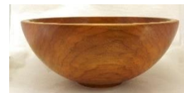
William Flint Grand Cherry Bowl 2019 Cherry, 20015, Oil and Wax finish 7.5" x 18.25" x 18.25" $800