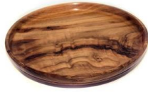
Joseph Barnard Stream of Gold 2020 Chinese Chestnut Tray filled with pearlescent gold epoxy 1" x 10.5" x 10.5" $147