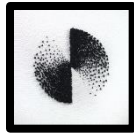
Sarah J. Hull Condensate

Digital pigment print on a handmade, unique antique linen, containing lace edges 16" x 14" $275