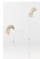
Kaitlin O'Keefe A Thread To Bare

2020 cotton, silk, screenprinting, applique 24" x 36" $2,000