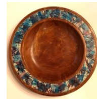
Rod Stabler and Ann Ruppert Azure Pools Crotch cherry wood platter with string inlay and polymer clay and alcohol ink tile inserts 2" x 13" x 13" $600