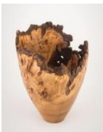
Michael Summers Wych Elm Vase 2018 Wych Elm Burl 7" x 7" x 6" $975