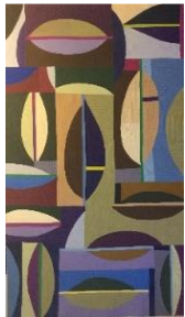
Marina Baudoin Clamshell III

2017 Various fabrics and thread, embroidery, piecing, appliqué, quilting 40" x 51" $6,000