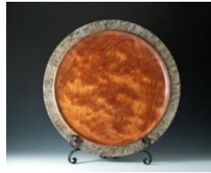
David Swiger King's Plate 2018 Bubinga 1.25" x 15" x 15" $1,000