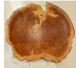
Richard Webster Large Redwood Lace Burl Platter 2019 Redwood lace burl 4" x 15" x 15" $320