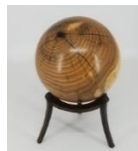
Paul Sandler Alien World 2019 Black Locust Sphere on Tripod Stand, Epoxy Embellishment 6" diameter $105