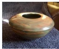
David Termini Wood Motion 2018 Box Elder wood, lacquer finish with multiple coats, special techniques with stains and glazes, color between coats of finish using special brush made from traditional brush 9" x 18" x 18" $850