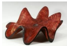
Andy DiPietro Along the Reef 2018 Dyed Oak Turned Sculpture 5" x 17" x 14" $2,800