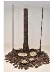
George Lorio Clear Cut

2019 Textile, sewing, quilting, silk and thread in the format of traditional Korean object-wrapping cloth 18" x 18" $500