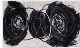
Judy Kirpich Memory Loss No. 1

2019 Hand embroidery, silk, cotton 9.75" x 9.75" x 1.75" $625