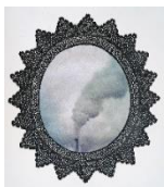
Catherine Day Plume-oval

2019 100% cotton, machine pieced and quilted 88" x 52" $2,700