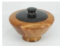
Paul Sandler Hollow Form with Lid Florida Mahogany - Lid is Black "Hammered" Finish 9" x 7" x 7" $175