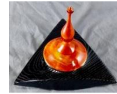
Robert Dorr Tricorne 2019 Charred and Brushed Ash base with dyed Quilted and Hard Maple finial 6.5" x 7" x 7" $175