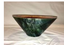
Stan Wellborn Untitled 2018 Maple burl with blue-green aniline dye 8" x 5.5" x 5.5" $150