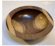
Jay St Michel Rounded Walnut Bowl 2019 Black Walnut 3" x 9" x 9" $250