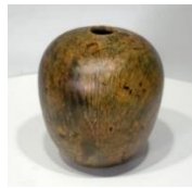
Andy DiPietro A Walk in the Woods 2019 Dyed Maple Burl Vessel 7" x 6" x 6" $1,250