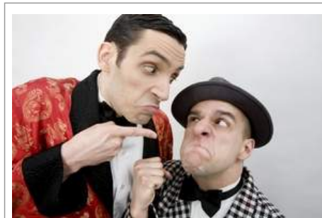
Physical comedy masters Parallel Exit is set to bring Vaudevillian family fun to BlackRock.

OK, well, not in your face at least. They're probably laughing on the inside ... unless it's your family who sees you fall, then